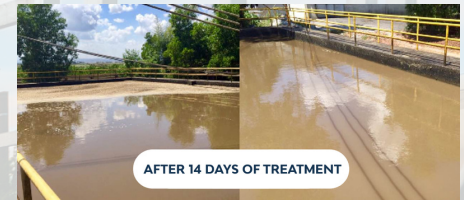
AFTER 14 DAYS OF TREATMENT